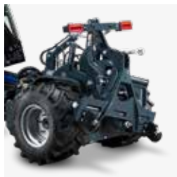
Three-point mounting frame Cat. 1, pivotable (15°) and with side shift