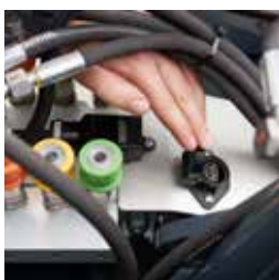
Switchable 12V socket according to DIN 9680