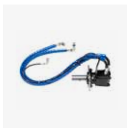
PTO 2 OMT 160 cc (For high-performance accessory units where both piston pumps are used to drive a PTO)