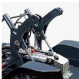
Linkage with hydraulic block