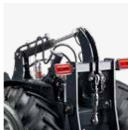
Hydraulic top link