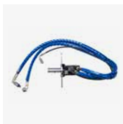
PTO 1 OMS 80 cc (using 1 piston pump)