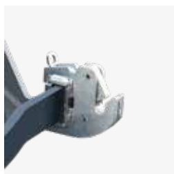
Quick-release hooks for linkage type Fendt Ø 22