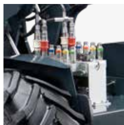
Double-acting hydraulics (1-2-3-4)