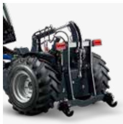
Three-point mounting frame Cat. 1