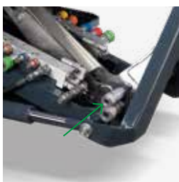
Ports for the second gear pump