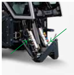
Continuous hydraulic flow