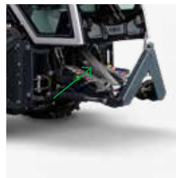
Hydraulic top link