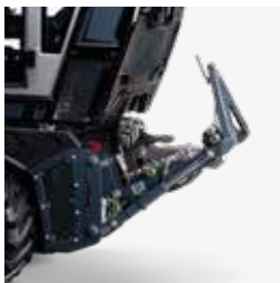
Front linkage with Category 0 A-frame