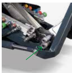
Ports for the PTO