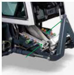
Hydraulic power unit & 12V socket