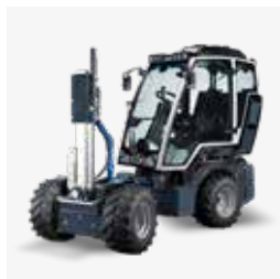
Implement mast with hydraulic block unit & additional hydraulic functions