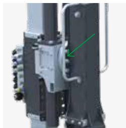
Quick rotation system (180°)