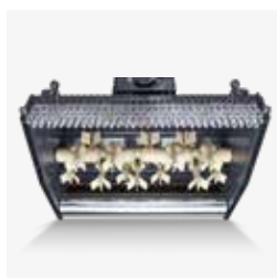
Mower model SM90 with a working width of 90 cm