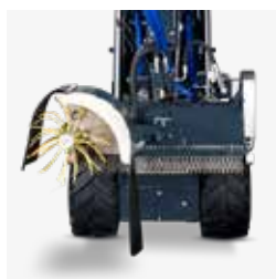
Hydraulic shoot remover (on request: individually controllable brush)