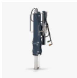
Swivel system with 500 mm telescope