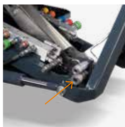
Ports for the PTO