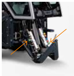
Continuous hydraulic flow