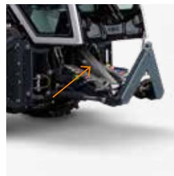
Hydraulic top link